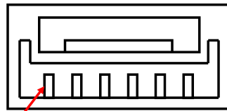
4-pin JST Connector